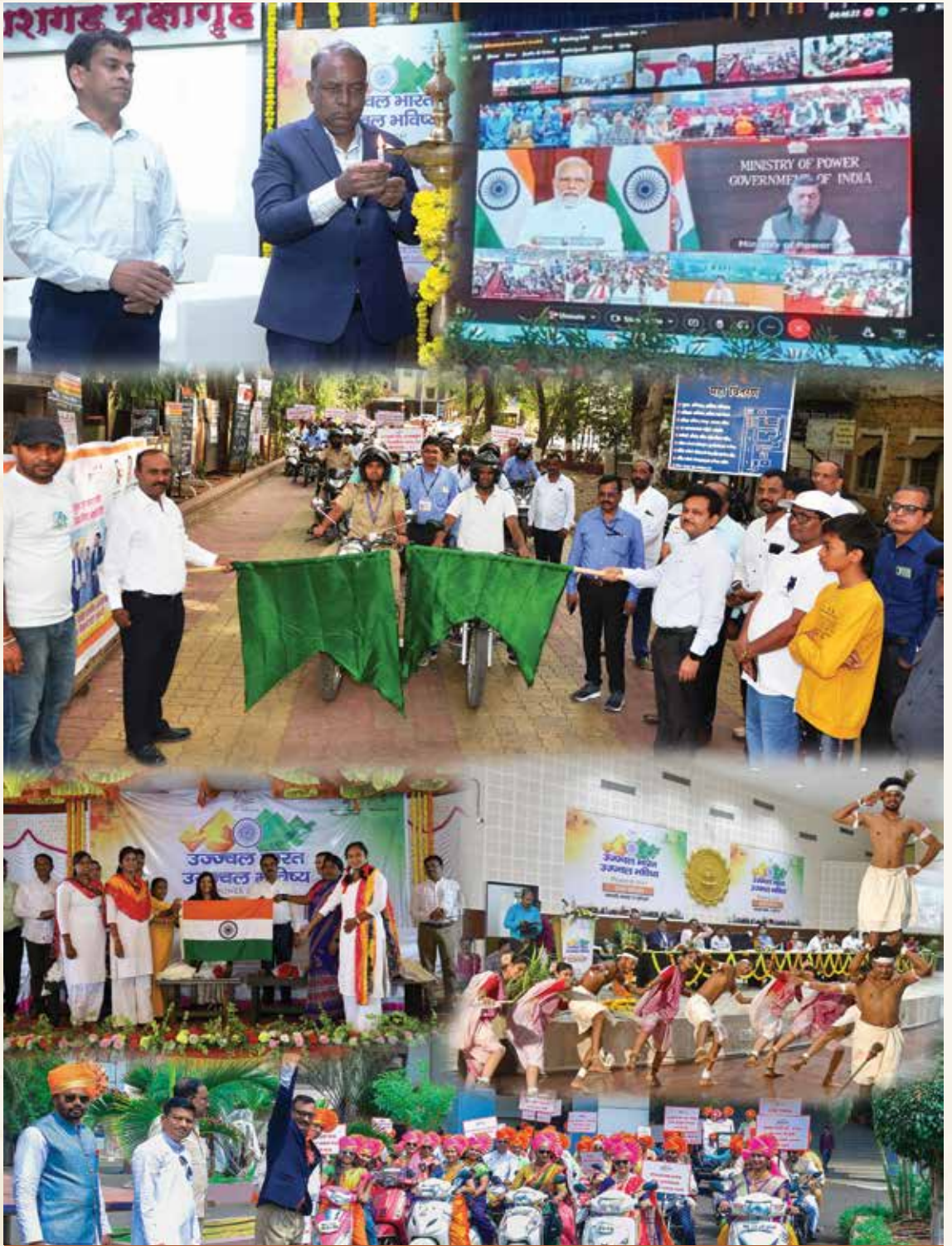
स्वातंत्र्याच्या अमृत महोत्सवी वर्षानिमित्त आयोजित 'उज्ज्वल भारत - उज्ज्वल भविष्य' अभियानातर्गत महावितरणकडून राज्यभर विविध कार्यक्रमांचे आयोजन.